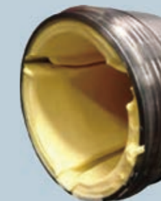
The separated solid sediment